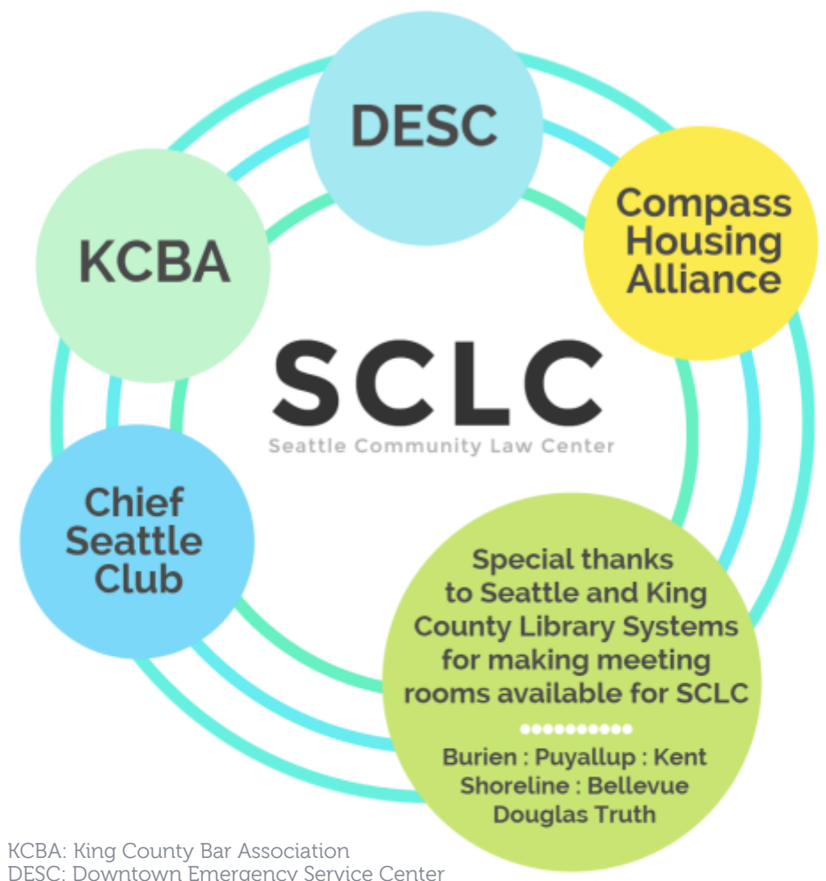
KCBA: King County Bar Association DESC: Downtown Emergency Service Center